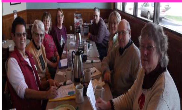
Caught in the Act!! The Vesper WCMGV gardening team at a recent breakfast meeting. Hmmmmmm, so who took the picture?

The Spring Educational Seminar is Scheduled for April 9th at MSTC Wisconsin Rapids