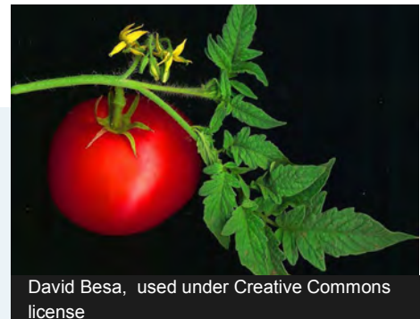
David Besa, used under Creative Commons license

Bring at least two of your best tomatoes, some for appearance and some to be cut up for the taste testing. Unusual and Heirloom varieties are encouraged. Prizes will be awarded!